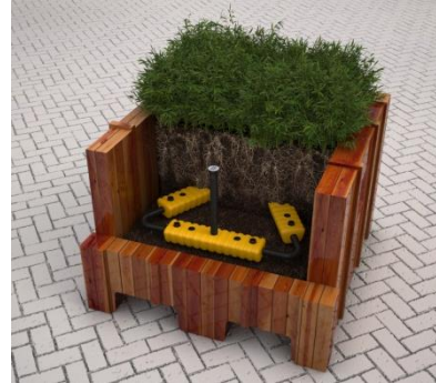
MPS Link 3 (shown in 3-link configuration)